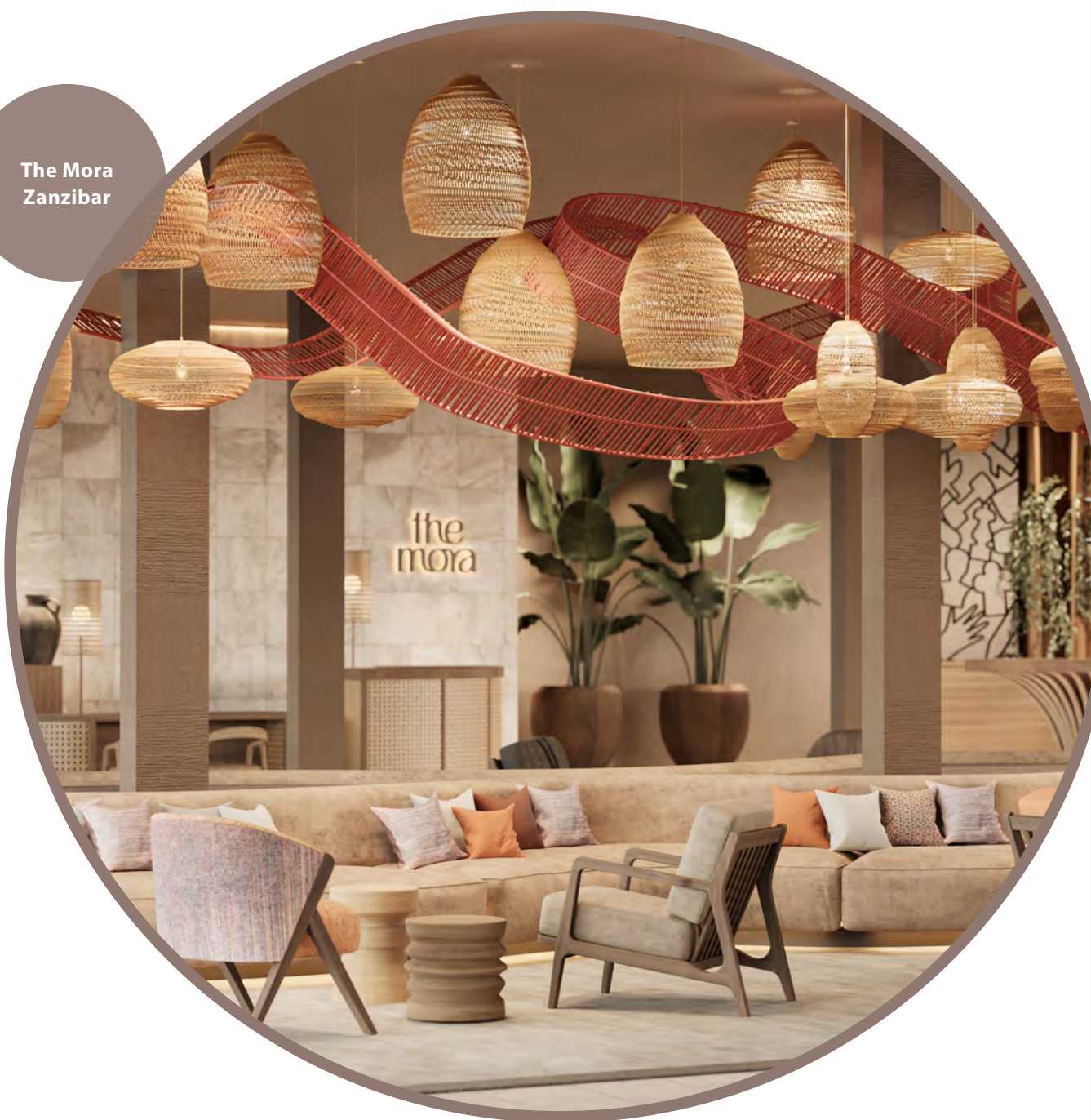
The Mora Zanzibar