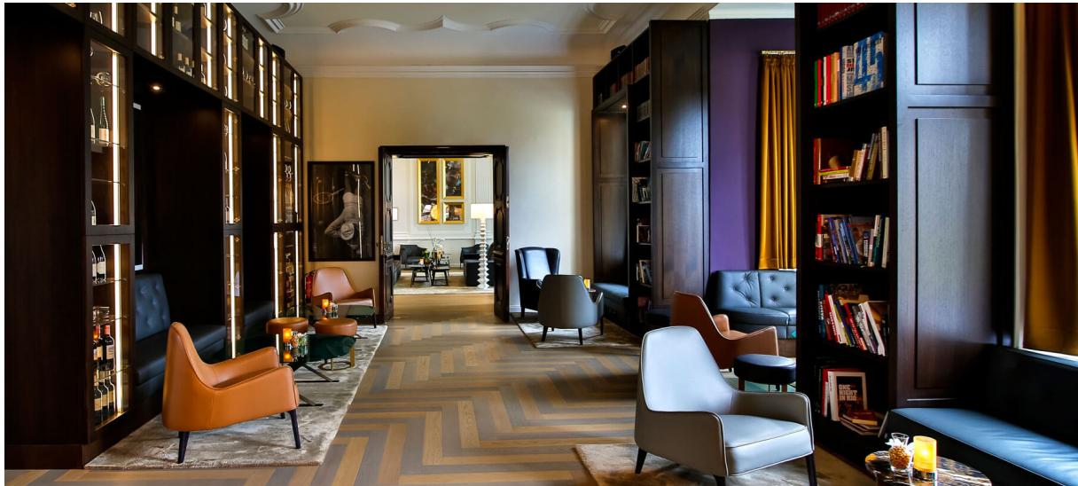
Lounge Schloss Fleesensee

This comprising know-how makes Kitzig Design Studios International a strong reliable partner, which is verified by an international client base.