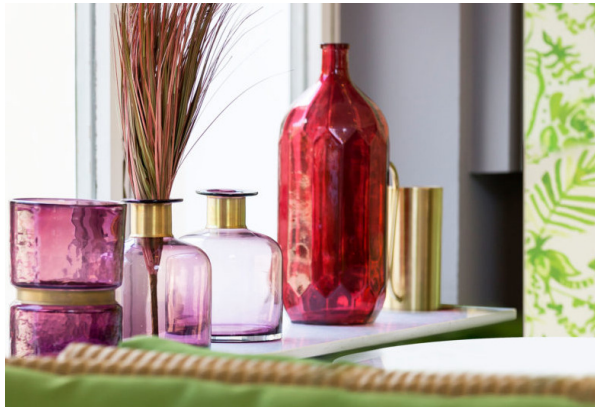
Cafe Kakadu

material manager for Kitzig Interior Design. The company Kitzig Details arose out of a constant development of the fields of activity and a wide spread network.