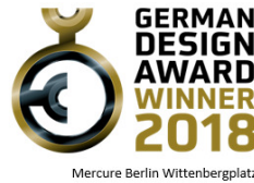
Mercurie Berlin Wittenbergplatz