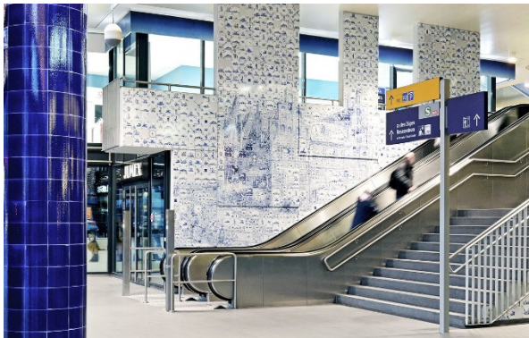
Wall Design for Deutsche Bahn AG