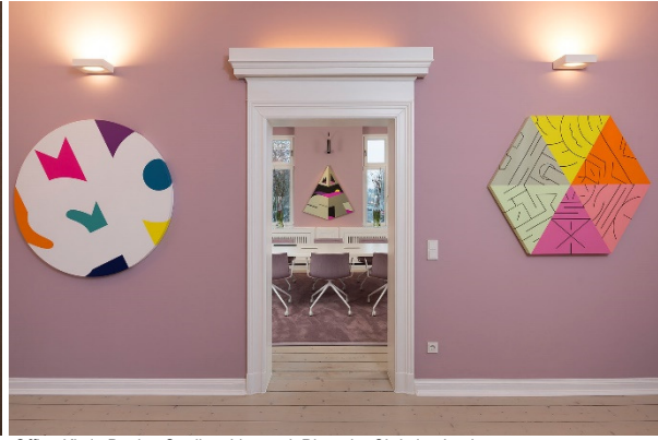
Office Kitzig Design Studios, Lippstadt