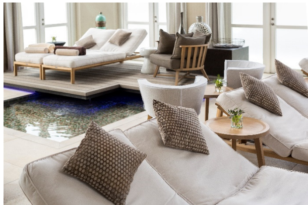
Spa Schloss Fleesensee, Photo by Christian Laukemper