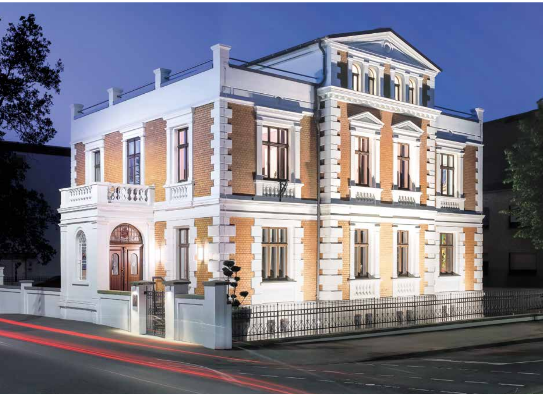
Kitzig Design Studios was founded in Lippstadt. The office is located in a renovated city villa.